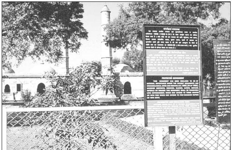
Fig. 4. At the Shehri Masjid in Champaner, the Archaeological Survey of India has encircled the site with a metal fence, which cuts through the mosque's original landscape context.