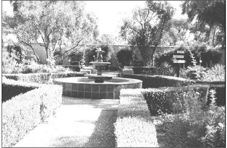
Fig. 3. Mission Santa Ines, California, c. 2000.