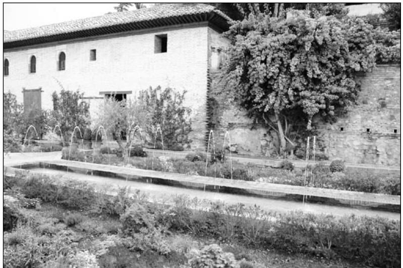
Fig. 5. At the Generalife Palace, Granada, brilliantly colored but historically inaccurate bougainvillea climbs the walls.