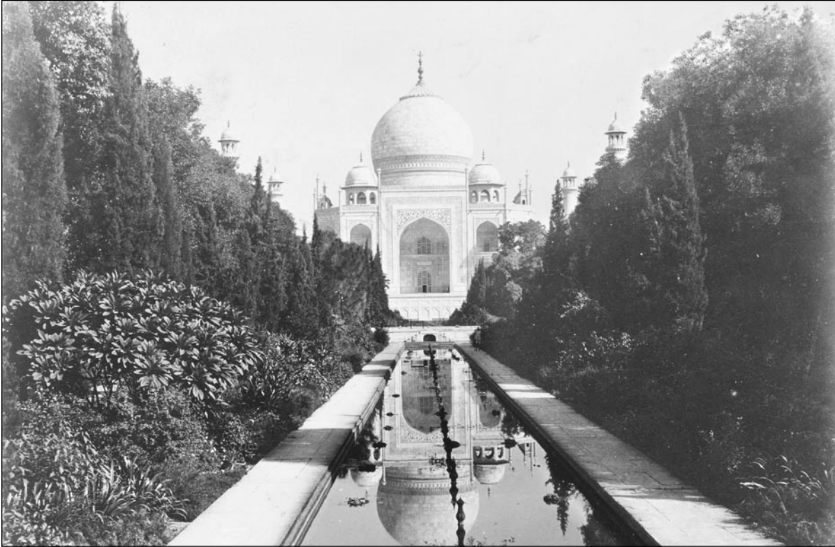
Fig. 2. Taj Mahal in the 1880s. The vegetation is dense and obscures the view of the garden.

Similarly, while the Archaeological Survey of India (ASI) is committed to architectural preservation, the enormous number of monuments requiring protection means that one of the key strategies is simple fencing to limit access and discourage theft of sculpture and architectural ornament. The spatial field created by the fence reflects preservation values: the building—preserved as well as can be expected within the financial constraints of ASI—stands at the center of the designated precinct, while the surrounding gardens are either ignored or replanted in a contemporary style (Fig. 4). Invariably, the ornamental pools stand dry, their fountains silent. It is often impossible to advocate for authentic water features when surrounding communities have barely enough clean water for drinking, bathing, and farming. This underscores one of the fundamental challenges of garden preservation: it cannot be disconnected from larger ecological and social issues.