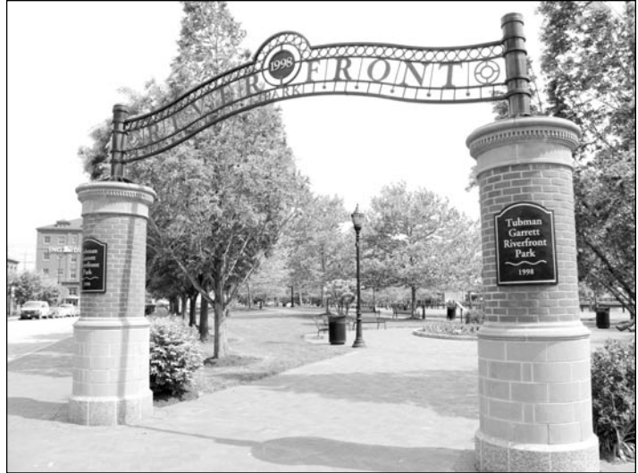
Figure 4. Tubman-Garrett Riverfront Park, N. King Street, Wilmington, New Castle County (Photograph by David Ames).