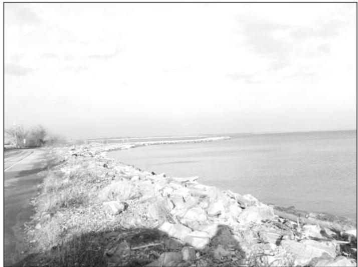
Fig. 5. Delaware State Route 9 shoreline in New Castle County with a view to New Jersey.