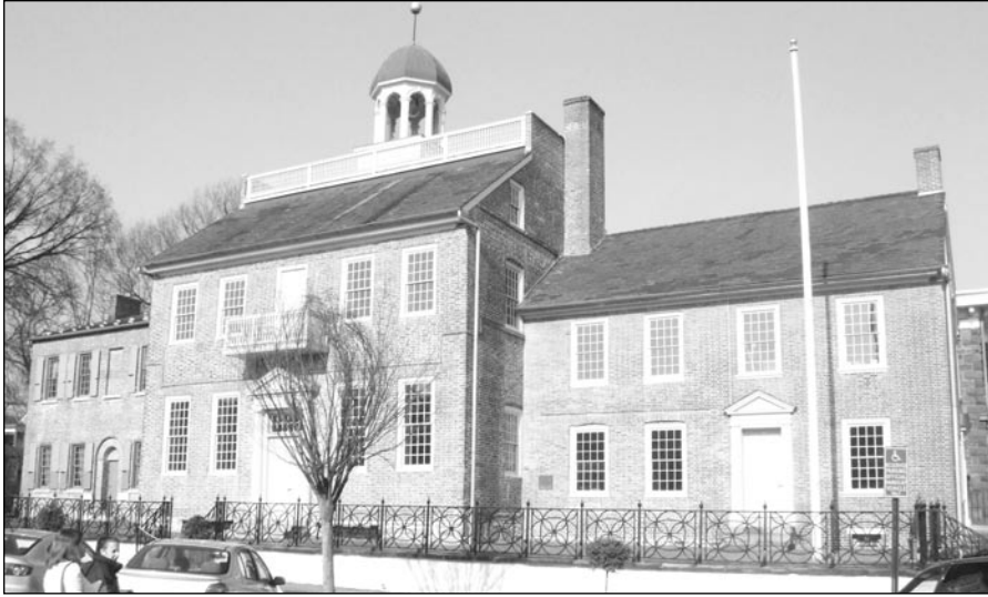
Fig. 3. Delaware State House, The Green, Dover, Kent County.

houses in the nation. Strong, local, oral tradition says that freedom seekers may have used the upstairs eaves closet as a hiding place. Prominent abolitionist Quakers met here for weekly worship.